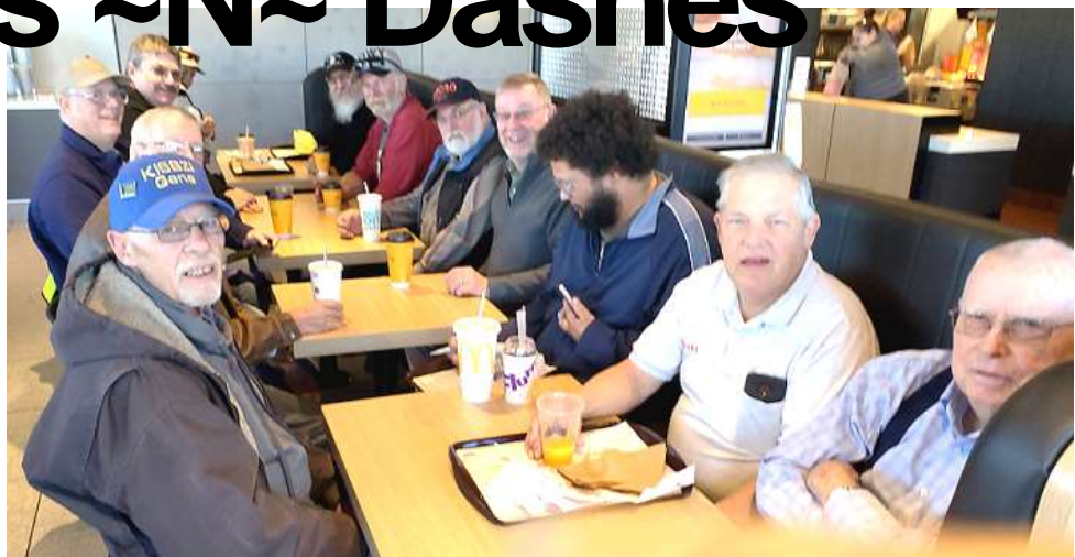
SATURDAY BREAKFAST CLUB

Valencia County Amateur Radio Association P.O. Box 268 Peralta, New Mexico 87042