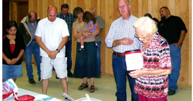
September Potluck began with prayer.